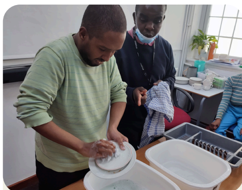
Independent Living Skills