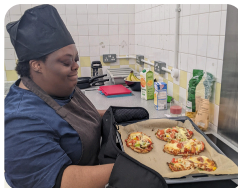
Home Cooking Skills