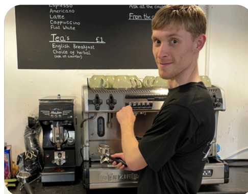
Working in our community café