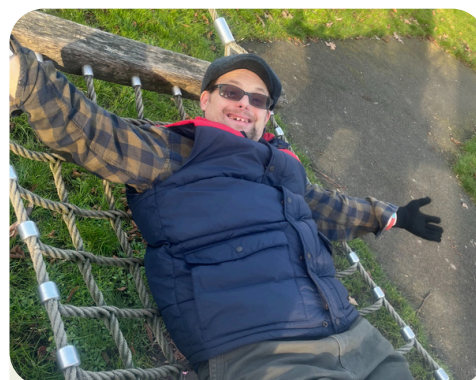
Health and wellbeing