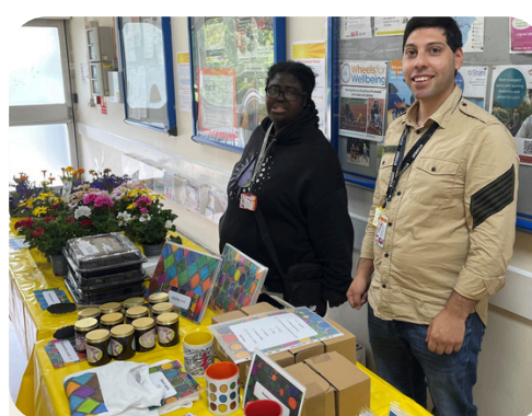
Steps into Employment