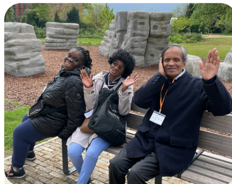
My Life, My Way