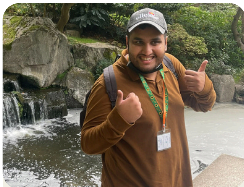
Out and About